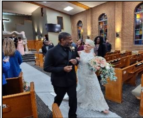
Above: And we are off.....