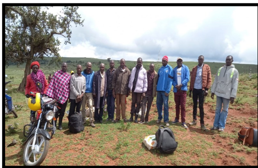
Left: The building team arrives at Osarara