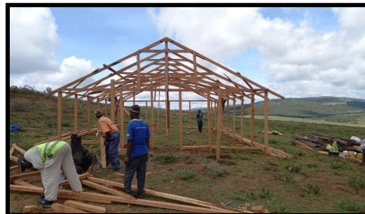
Bottom: Osarara church in progress