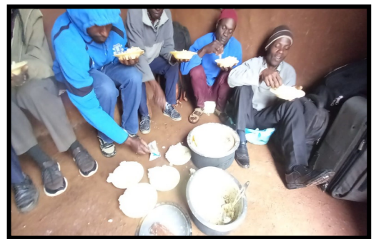
Right: Much needed nourishment for the building team