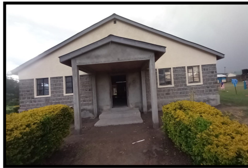
Left: Completed and much improved dormitory