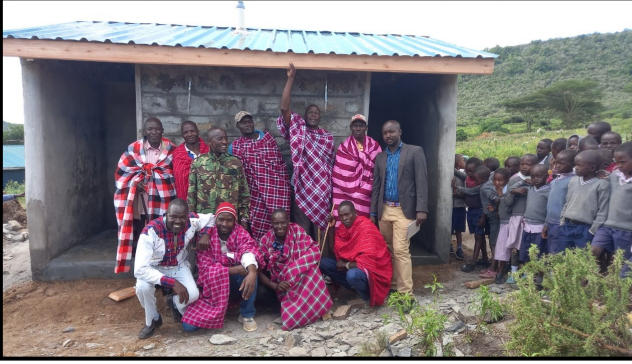
Left: New toilet, first in whole area