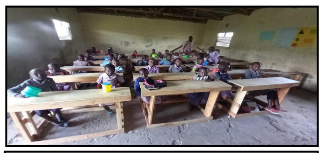
Right and Left: New desks

NKORIKA DESKS AND TOILETS: Seventy desks were made for the school plus four large teacher desks with drawers. Each desk seats three students. The four stall toilets were completed, made of blocks. When the building was complete it was commented by some of the villagers. "We have never had such a building in this area, it is nice enough for someone to live in them." A celebration was given by the community for the builders and personnel of MDP.